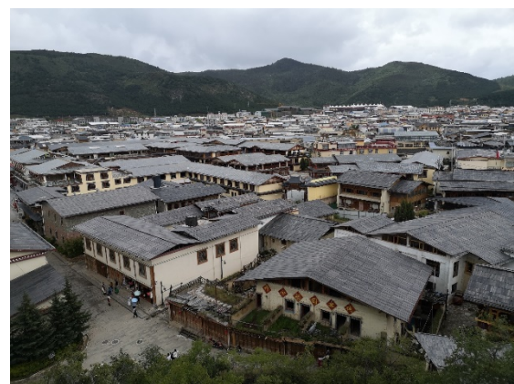
Figure 9: A view of larger residential units on the edge of Shangri-La's old town

The low-rise central parts of the city are infested with tourist facilities and industries, where commercialized areas represent the vast majority of Shangri-La's downtown. The city has more normative and narrative values than Dali and Lijiang, making it more special for tourists. While it is located in a remote part of the province, it also benefits from Tibetan architectural characteristics and community settings. In particular, the larger vernacular housing units with local material use play a major part in creating a unique atmosphere of a genuine heritage zone in the province. In making Shangri-La to become what it is now, there has been major tourism development, and economic growth motivations have lasted for more than two decades (He, 2021). The name of the city itself is based on a “ new economic development strategy based on domestic tourism ” (Golley, 2018), indicating that it has been strategically selected for new development and tourism projects. Debates on the earlier politics of cultural production also show criticism of the pragmatic use of the Shangri-La myth (McGuckin, 1997) for the later – but eventual - displacement processes.